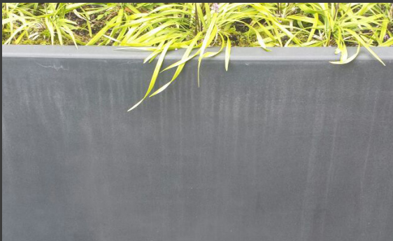
Fibreglass planter after 5 years before treatment